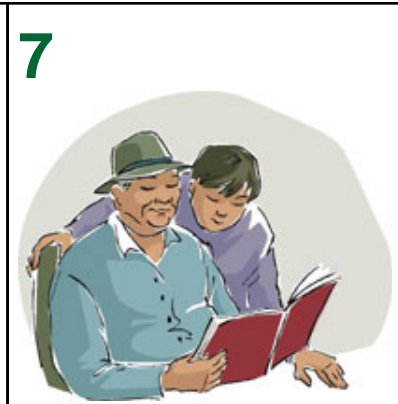
National Pearl Harbor Remembrance Day