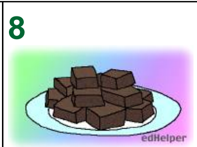
James Thurber's Birthday