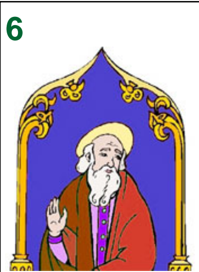
St. Nicholas Day