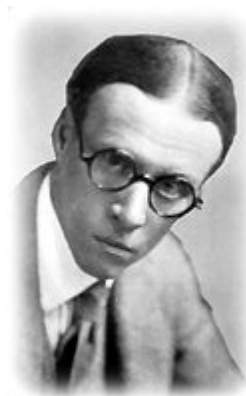
Birthday of Sinclair Lewis