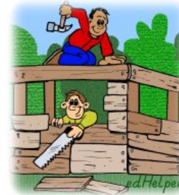
Robinson Crusoe Day