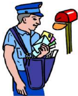
Thank a Mailman Day