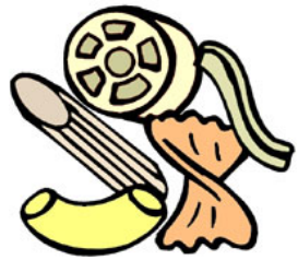
National Noodle Month