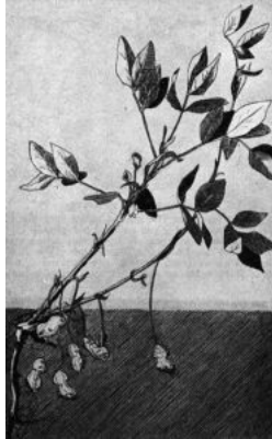
National Peanut Month