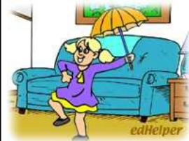
National Open an Umbrella Indoors Day