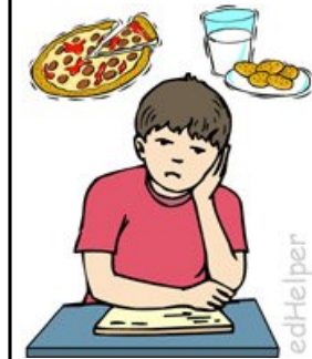
School Breakfast Week