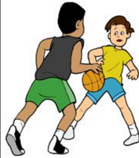
Fun Facts About Names Day