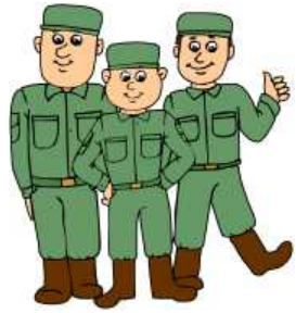
Hug a GI Day