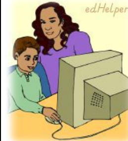
Electronic Greetings Day