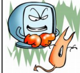
Computer Security Day