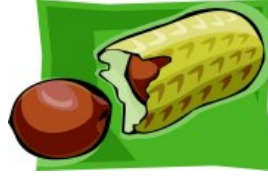
Peanut Butter Fudge Day